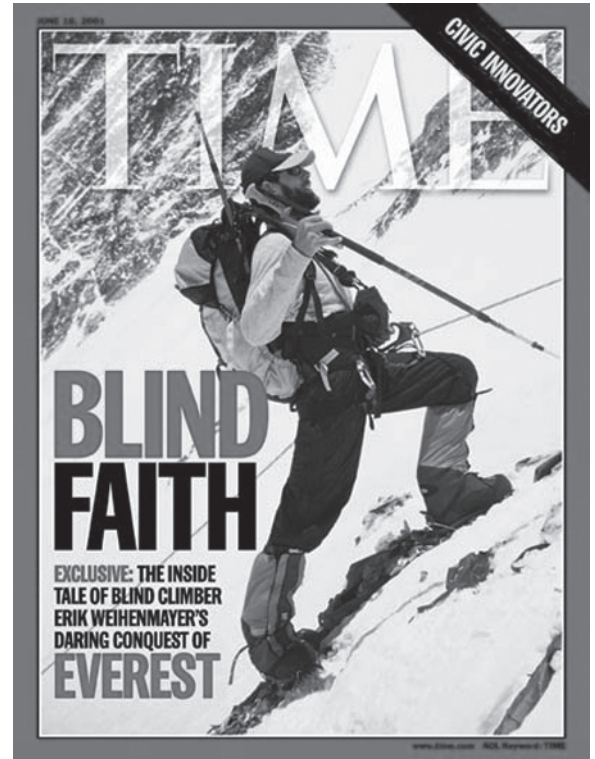
Time Magazine, June 18, 2001

the rock face of Yosemite’s El Capitan, the icefall of Polar Circus in the Canadian Rockies and—upon returning from Everest—the fibreglass Matterhorn at Disneyland.